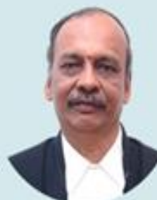
Hon'ble Justice Shri. S. Baskaran Chairperson, SHRC Tamilnadu

DATE: 14.12.2022 TIME: 10.00 AM VENUE: SEMINAR HALL