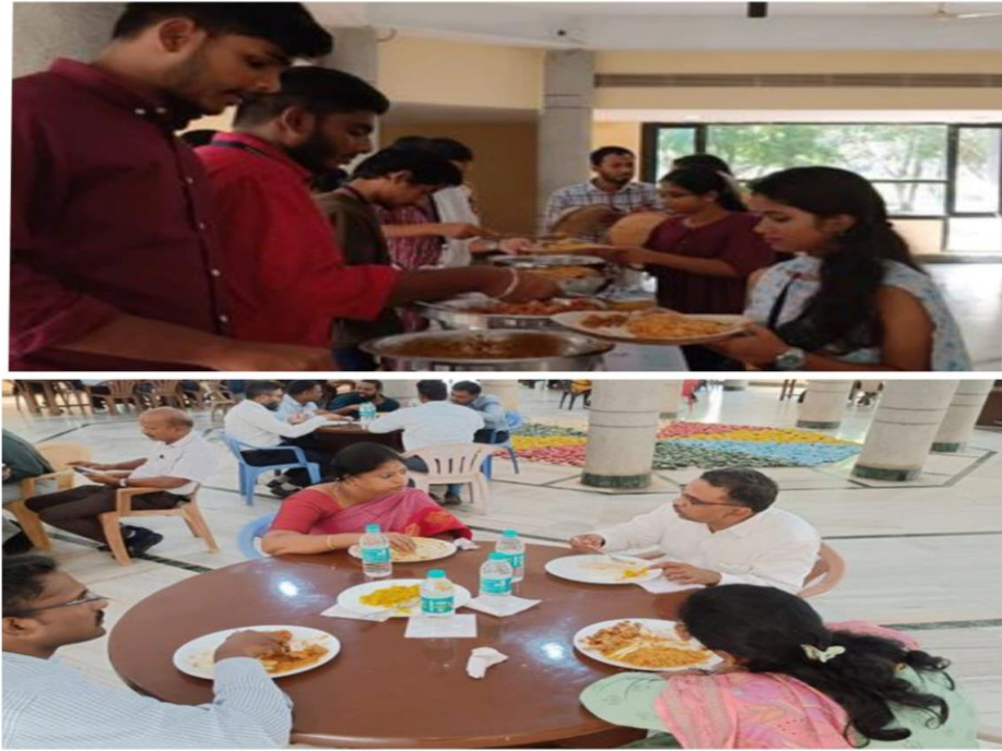
Figure 7: Lunch for the Participants and Resource persons