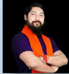
Shri Nisith Pramanik Hon'ble Minister of State Ministry of Youth Affairs and Sports