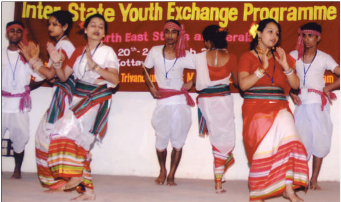
North-Eastern Youth performing cultural activity in the Inter-State Youth Exchange and Home Stay Programme