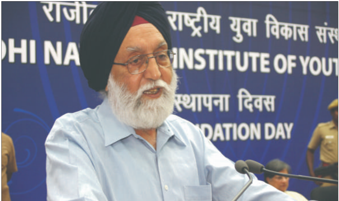
Dr. M.S.Gill, Hon'ble Minister of State for Youth Affairs and Sports (Independent Charge) delivering the RGNIYD Foundation Day Lecture - 2008