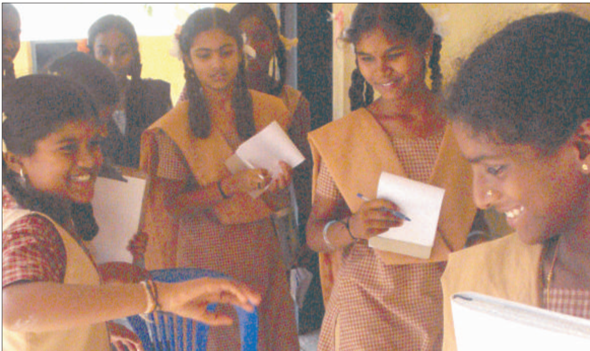
Adolescents undergoing Training on Life Skills