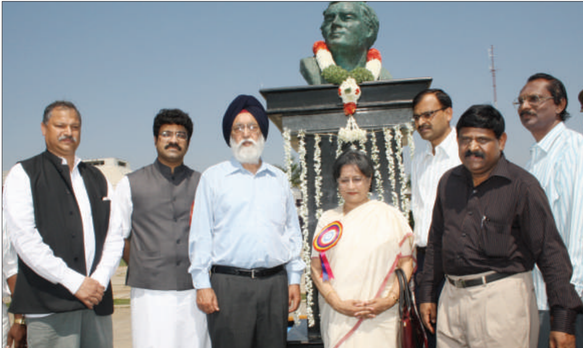
Dr. M.S.Gill, Hon'ble Minister of State for Youth Affairs and Sports (Independent Charge) at the bust statue of Late Shri Rajiv Gandhi in RGNIYD Campus