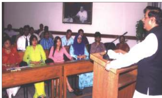
Hon'ble Union Minister Shri. Prithviraj Chavan addressing the International Delegates of "Management Competence for Youth Leaders" Programme

Youth Entrepreneurship, Role of Civil Society, Social Entrepreneurship, Role of International Institutions in National Development with Country-wise Case Studies. A syndicate discussion was held covering the key areas like Education, Poverty, Gender, Health, Entrepreneurship, Governance and Politics.