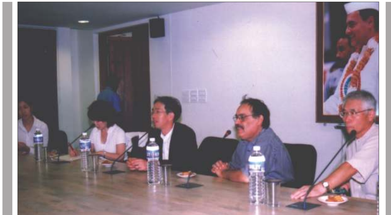
Japanese Delegation visits RGNIYD

Rajiv Gandhi National Institute of Youth Development