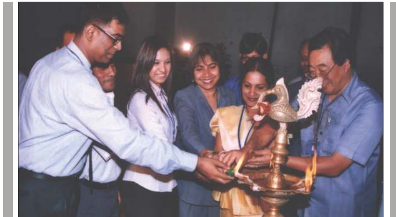
International Youth Delegates Lighting the Lamp to Inaugurate the RGNIYD - CYP Programme