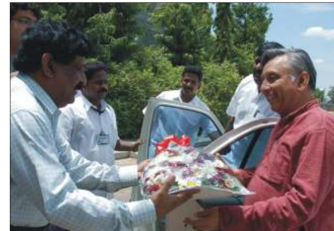
Honourable Union Minister for Youth Affairs and Sports visiting RGNIYD

Hon'ble Minister for Youth Affairs and Sports, Government of India, Shri.Mani Shankar Aiyar visited RGNIYD. The Hon'ble Minister desired that RGNIYD should function as a centre of interaction for the youth of different States in the country on Panchayati Raj and initiate a project titled "Youth in Panchayati Raj Campaign". This forum for inter-state