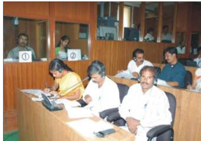
Simultaneous Interpretation System

The Hon'ble Minister of Youth Affairs and Sports visited this Institute on 8.2.2006 and desired that RGNIYD shall function as a Centre of Interaction for the Youth of different States in the Southern Region on Panchayat Raj. This forum of Inter-State interaction would enable the youth of each State to share their experiences with the youth