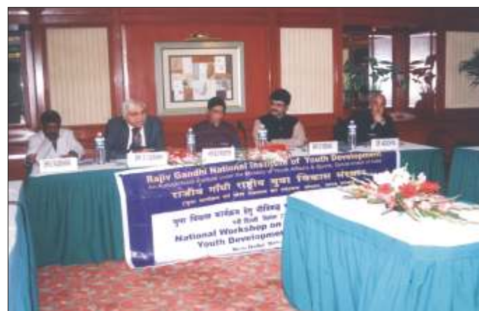
National Workshop on Strategic Plan for Youth Development Programmes at Delhi

RGNIYD in association with the Ministry of Youth Affairs and Sports, Government of India organised a two-day “National Workshop for Preparing a Strategy Plan for Youth Development Programme in the Country” from 27-28 December 2005 at Maple Room, India Habitat Centre, New Delhi.