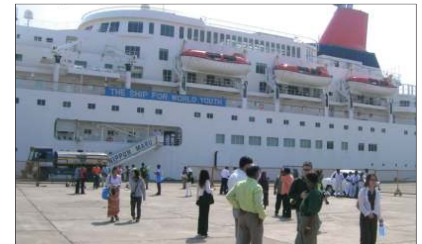
18th Ship for World Youth Programme arrives at Chennai

Counselling is a vital component in the process of personality development of youth. The problems of the Youth are multi-dimensional – psychological, physical, mental, physiological, academic, family relations, peer pressures etc. Youth workers and programme officers working closely with the Youth need to be equipped with counselling skills so that they can function as para / professional counsellors. A three-day training on counselling skills was organised by the Institute to cover the NSS Programme Officers / Coordinators from the North-east.