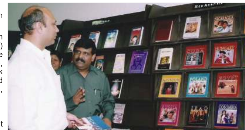
Shri. Pallam Raju, Chairman, Standing Committee on IT in RGNIYD Library