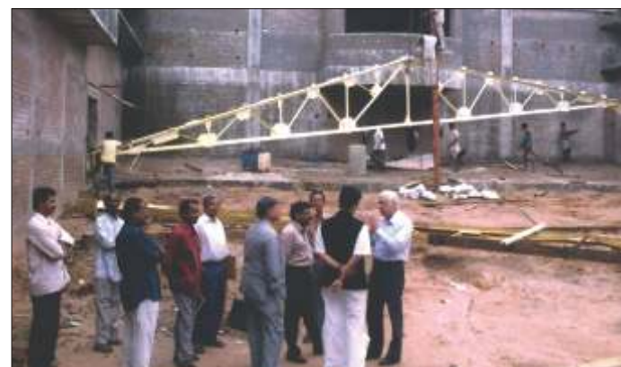
Auditorium construction in progress

Regarding the construction of an Auditorium in RGNIYD premises at an estimated cost of Rs.2,06,54,000/- the CPWD has furnished (revised) rough cost amounting to