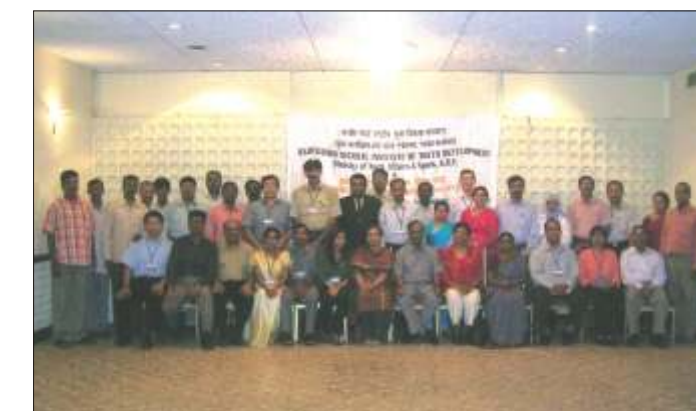
RGNIYD – CYP Programme on Youth Partnership and Entrepreneurship in Development

A Regional Seminar on “Youth Partnership and Entrepreneurship in Development in the context of Globalisation” was organised at Chennai jointly by RGNIYD and Commonwealth Youth Programme, Asia Centre from 22 – 26 July 2005. Twenty six participants from Asian Commonwealth Countries such as Bangladesh,