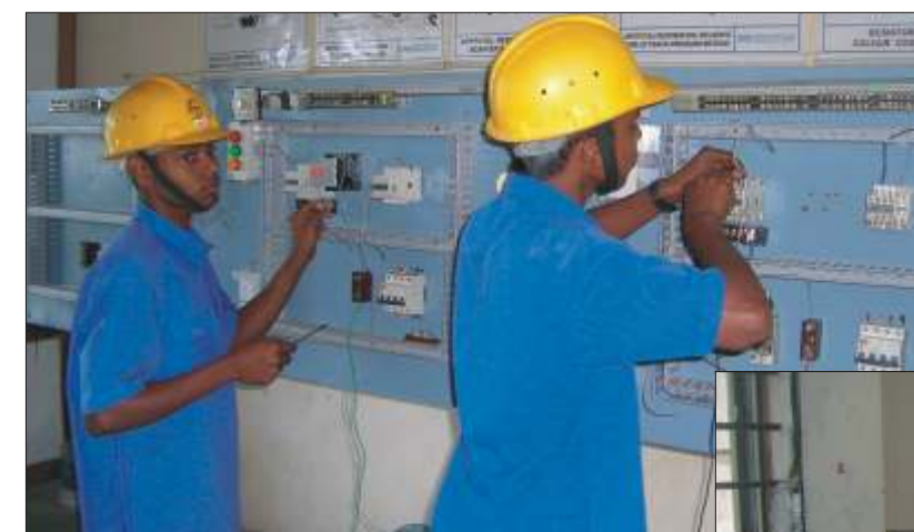
Enhancing Employability of Youth – A RGNIYD Initiative

Initiated a quick study on the Functioning of NYKS from different States. Data collection completed, sample comprised 70 NYKS District Co-ordinators who attended a training programmes at RGNIYD. Based on the above pilot study, we propose to undertake an evaluation study on the functioning of NYKS.