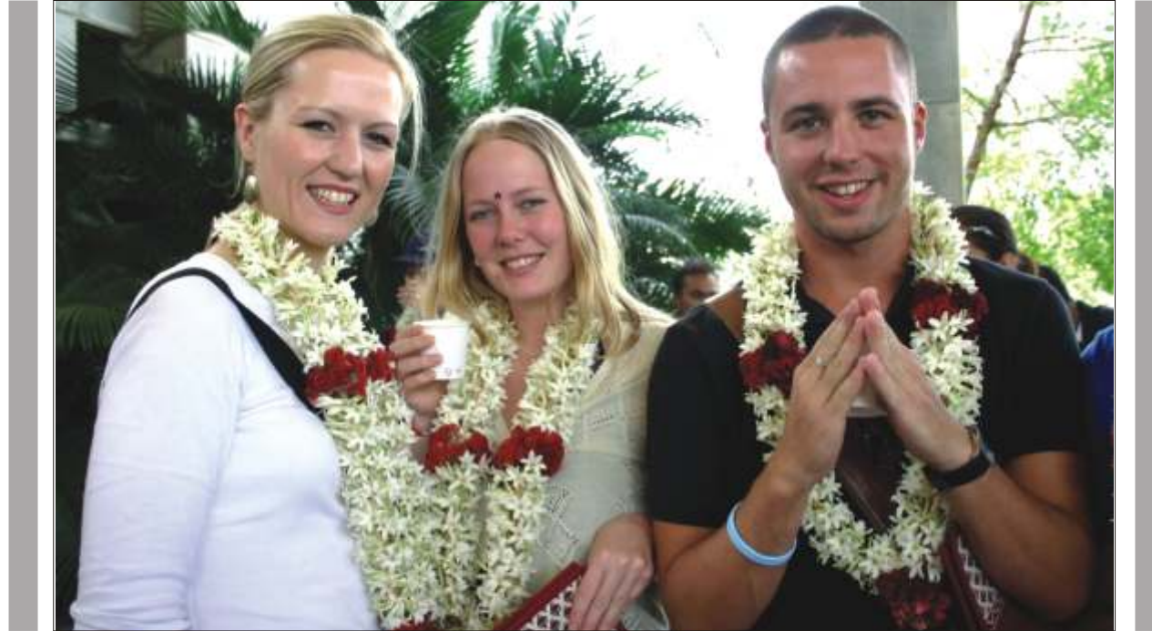
International Youth Delegates at RGNIYD