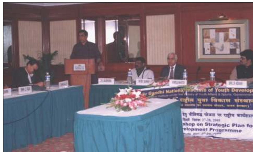
National Workshop on Strategic Plan for Youth Development Programmes

The Institute is mandated to develop programmes aimed at inculcating a sense of national pride, awareness of national goals and internalisation of national values among