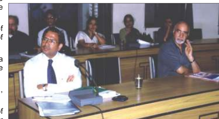
Youth Experts in National Workshop on Youth & Globalisation