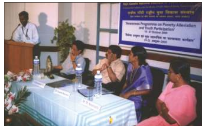
Poverty Alleviation Awareness Programme

The programme included vital sessions like Orientation on Rural Development Programmes, Field Experiences in implementing Poverty Alleviation programmes, Role and Functions of DYCs in creating awareness on poverty alleviation programmes, Marginalised groups and poverty