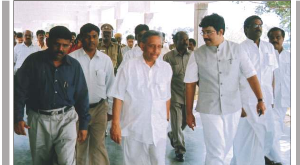
Shri. Mani Shankar Aiyar, Union Minister for Youth Affairs and Sports visits RGNIYD