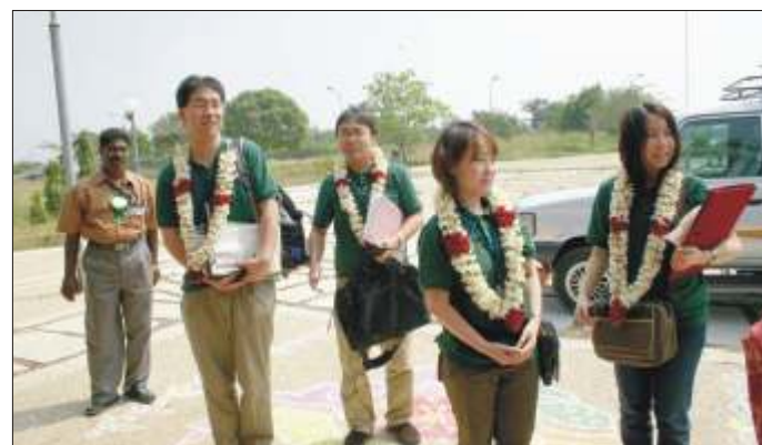
Delegates of 18th Ship for World Youth Programme at RGNIYD