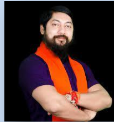
Shri Nisith Pramanik Hon'ble Minister of State Ministry of Youth Affairs and Sports