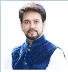
Shri Anurag Singh Thakur Hon'ble Union Minister Ministry of Youth Affairs and Sports